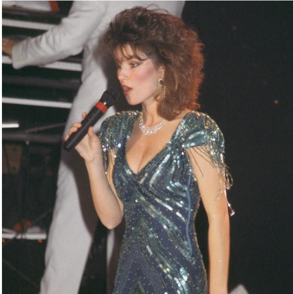
Eileen (Shania) Twain at Deerhurst, 1988