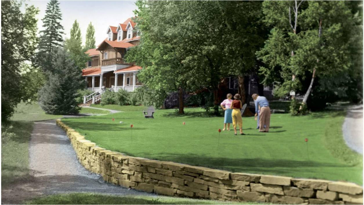
The putting green by the lodge, 1950s