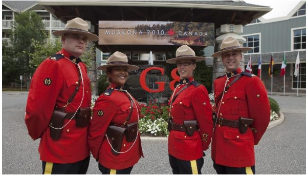
Host venue of the 2010 G8 Summit

In June 2010, Deerhurst made history as host venue for the 36th G8 Summit of world leaders including Barack Obama, Stephen Harper and Angela Merkel. Shortly after, the property was acquired by Skyline Investments in January 2011. Under Skyline, the new Golf Cottages residential community was developed around Deerhurst Highlands Golf Course and the Summit Lodges (renamed for the G8) were renovated.