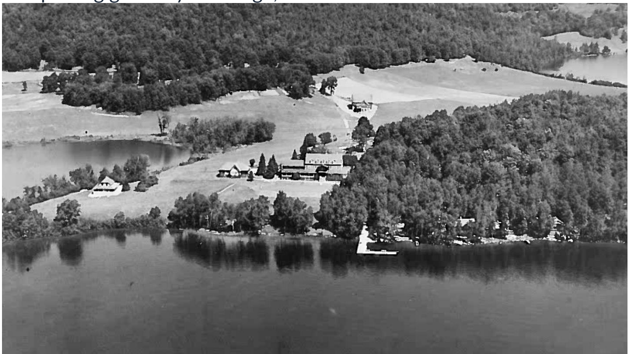
Aerial view of Deerhurst in the 1950s