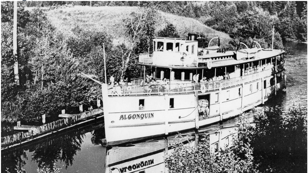
The Algonquin traversing the canal to Peninsula Lake