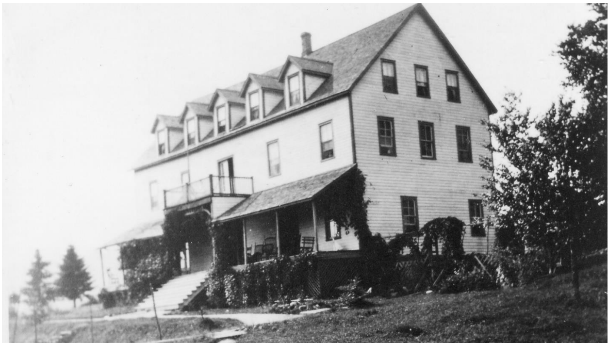
The original main lodge circa 1906

Covid-19 may have closed Deerhurst Resort's doors for three months early in 2020, but it has not been the first global crisis that the resort has witnessed and weathered, only to emerge stronger and more vibrant than ever. Throughout its 125+ year history, Deerhurst Resort didn't skip a year of operation during a century that saw the 1918 Spanish flu pandemic, two world wars, the great depression, numerous recessions plus serious downturns in tourism caused by 9/11 and SARS. Now that we have surpassed our 125th year, we take pride in reflecting on how Deerhurst Resort has shaped many memories for generations, and will for many generations to come. We hope you can add your own chapter to our resort history with a visit soon.